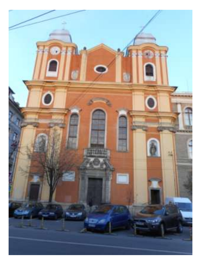
The Piarist Church

The next church is the Piarist Church or the University Church, dedicated to the Holly Trinity. It was finished in 1725 as the first baroque church from the region.