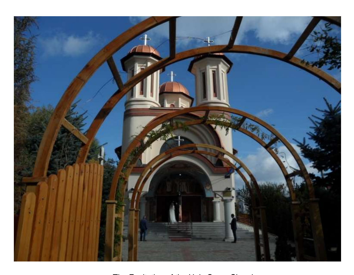
The Exaltation of the Holy Cross Church

The Exaltation of the Holy Cross Church is not oriented east - west because the deviation is 48^{\circ} . This is due to its location along the street.