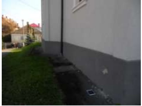
This church was built on the direction east - west and we found a deviation of 4^{\circ} .