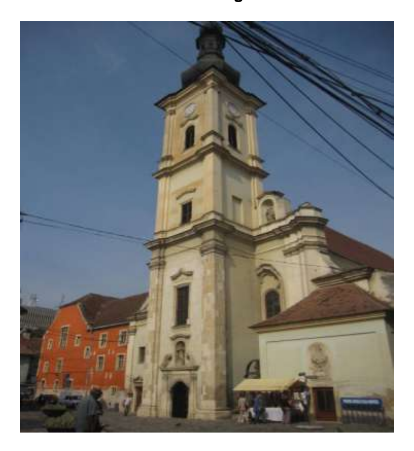
The Franciscan Church

Then we visited the Franciscan Church, which was build between 1260 and in the tardo – roman style. This is the oldest chatolic church from Cluj Napoca. Its orientation is deviated with 9^0 from the right direction.