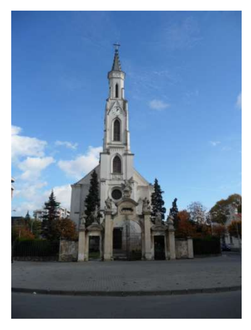
Saint Peter and Paul Church

The last Catholic Church in this presentation is Saint Peter and Paul Church . The present day Neo-Gothic church was built between 1844-1848. In this case, the deviation measured with the iPad compass is 22^0 but with a regular compass is 30^0 . The church is in a middle of an avenue and it is located parallel with the two parts of it.