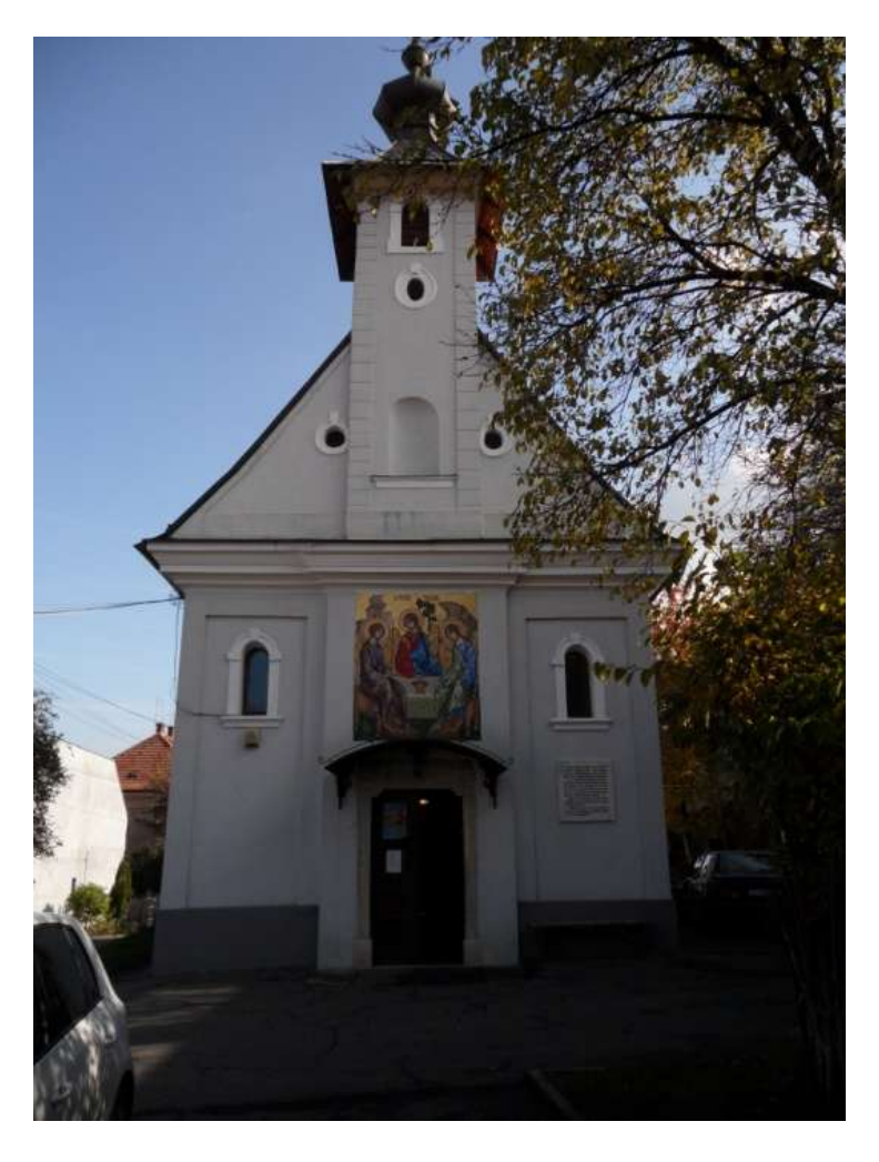
The Holy Trinity Church

The Holy Trinity Church is the first Orthodox Church from the city. It was built in 1796 in baroque style.