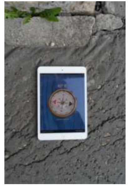
The St. Michael Church