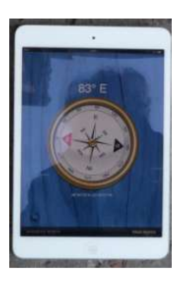
As you can see the deviation from the east – west direction in this case is 6^{\circ} (mesured with a regular compass) and 7^{\circ} (meassured with the iPad compass application).